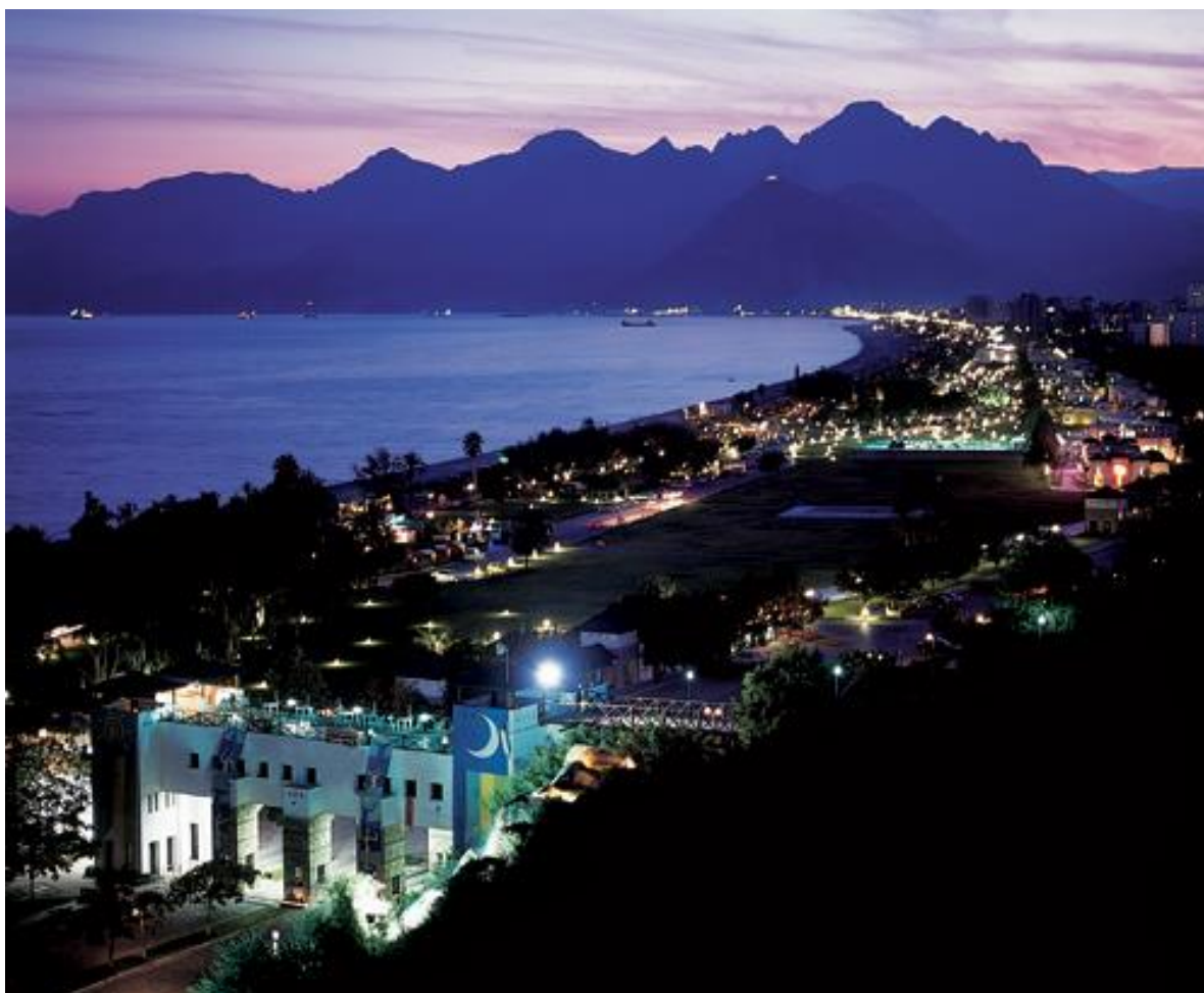
Night view of Antalya, Turkey