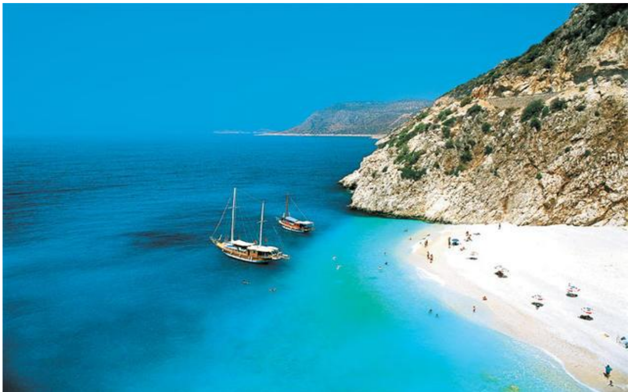
The Mediterranean coast, Antalya, Turkey

End of Day 2 and of the Alliance 2015 Global Conference