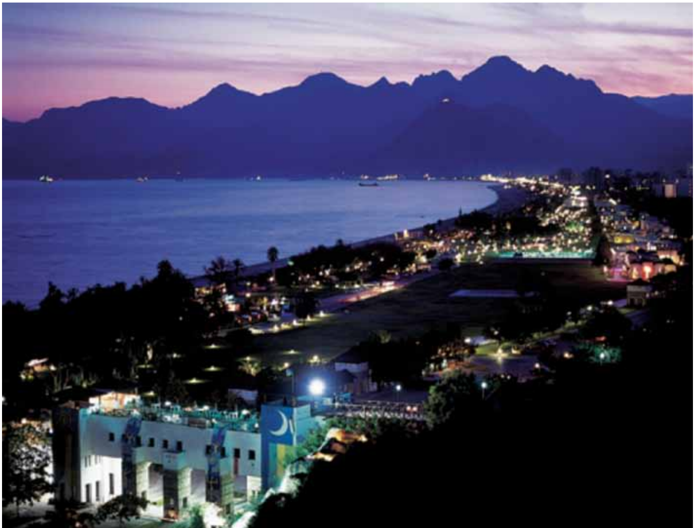
Night view of Antalya, Turkey