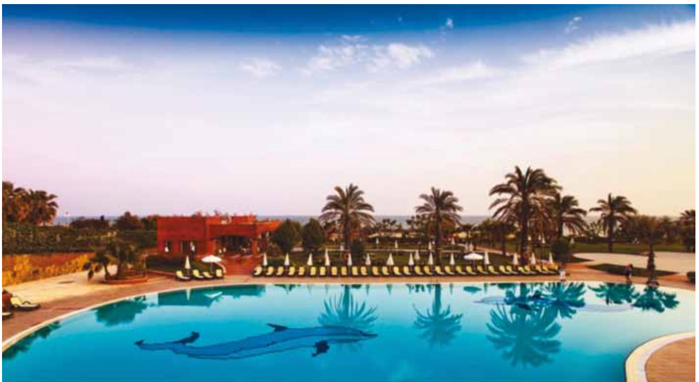
The Maritim Pine Beach Resort, Belek, Turkey - Venue of the 2015 Alliance Global Conference