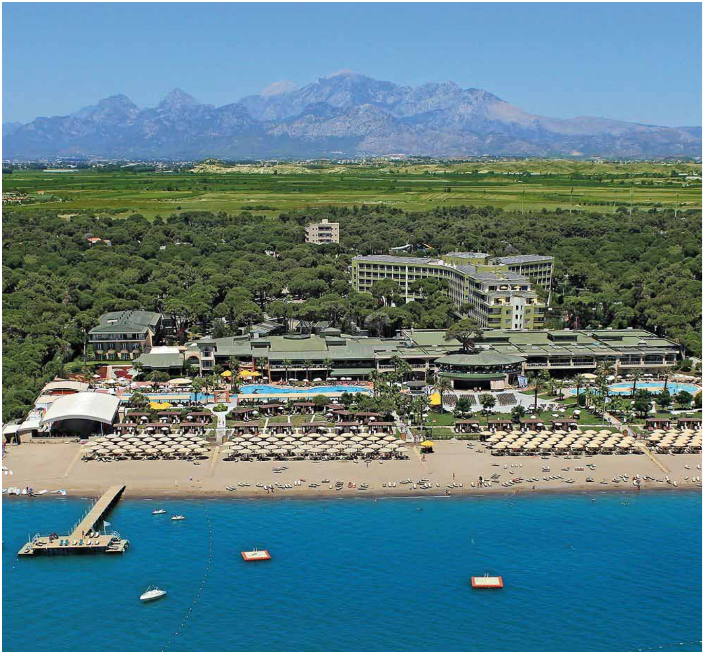
The Maritim Pine Beach Resort, Antalya, Turkey - Venue of the 2015 Alliance Global Conference