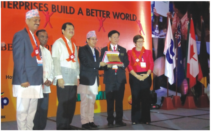
ICA President at the Forum

The Association of Asian Confederations of Credit Unions (ACCU) held the Asian Credit Union Forum on 7th ~8th September 2012 in Manila Philippines at the Crowne Plaza Galeria Hotel. In the