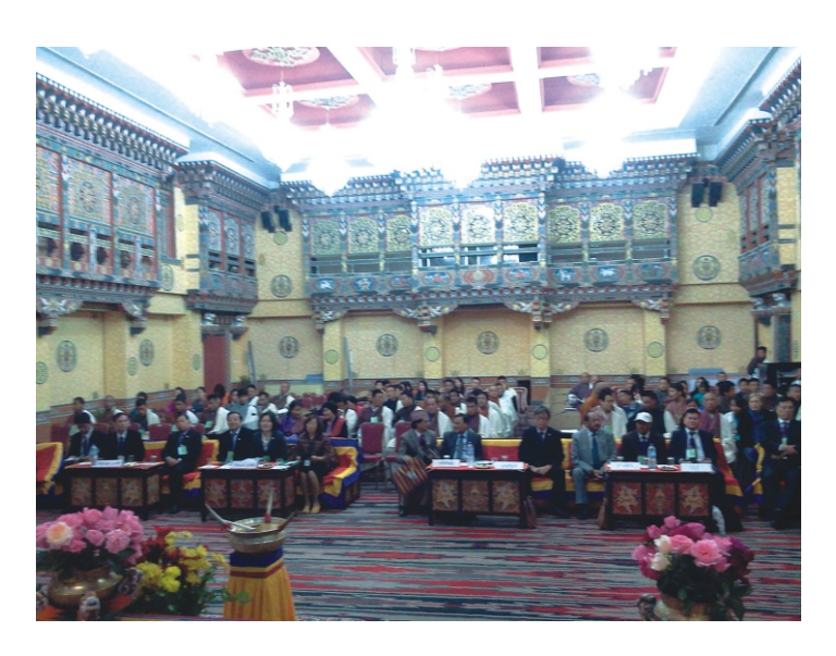
View of the opening of the seminar in Thimpu

The International Seminar on "Co-operatives: Empowering Communities Towards Gross National Happiness" was held on 8th –10th, October 2012 in Thimphu, Bhutan. This is the first ever International seminar organised on co-operatives.