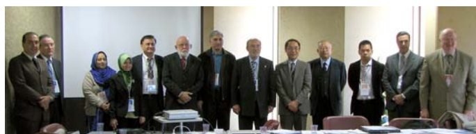
IHCO members at the IHCO General Assembly, Geneva

IHCO maintains a website and issues a newsletter to provide current and future members updates in the field.