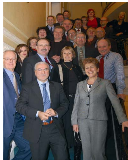
Cooperatives Europe Board

The full commissioning of the 'Cooperative House' in Brussels is now providing an efficient home for the governing structures of Cooperatives Europe and it enables the secretariat team of 5.5 full time and 1 intern to maintain a fully functional visibility to the outside world whilst providing a supportive centre for delivering services to our members.