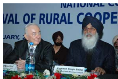
ICA President with the Co-operative Minister of Punjab

ICA AP was invited to participate The Co-operative Societies Forum by the Ministry of Social Affairs in Saudi Arabia held in Riyadh on 24-26 May. The objective of the Forum was to promote the scope and potential of co-operatives in the largest country of the Gulf Co-operation Council (GCC) sub-region. ICA was invited to the Forum to provide a global perspective to the deliberations at the Forum. It was attended by more than 150 delegates from Saudi Arabia and other countries of the GCC sub-region including the United Arab Emirates, Kuwait, Yemen, Bahrain and Oman.