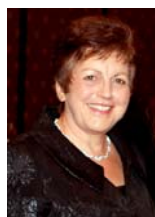
Dame Pauline Green, Co-operatives UK, (elected 19 November 2009)