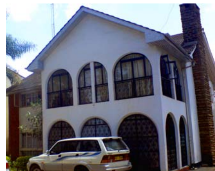
ICA Africa Regional Office

The ICA Africa Members' Forum held in May 2008 recommended that an Endowment Fund be set up to ensure the long term sustainability of ICA Africa. This recommendation was approved at the ICA Africa Regional Assembly held in Abuja, Nigeria in November 2008. In early 2009, ICA Africa commissioned the formulation of the terms of reference (ToR) on the preparation of a feasibility study to establish the viability and practicality of the proposed Fund. The overall scope of the feasibility study is to provide a report on the financial viability of establishing an Endowment Fund to finance the operating expenses of the ICA Africa Regional Office on a long term sustainable basis and also to explore other innovative ways of subsidising the investment returns from the Endowment Fund. The ToR was followed by a bidding process.