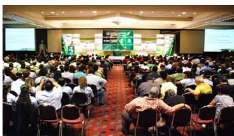
1st Co-operative Summit of the Americas, Guadalajara (Mexico)

During 2009, the number of countries in which ICA has member organisations remained stable. The year began with 69 member organisations, 3 of which associate members and ended with a net increase of seven new members. At year end, the region counted with 76 members and an additional member admitted but not yet formally a member. The ICA also counted with 3 withdrawals of member organisations covered by the region.