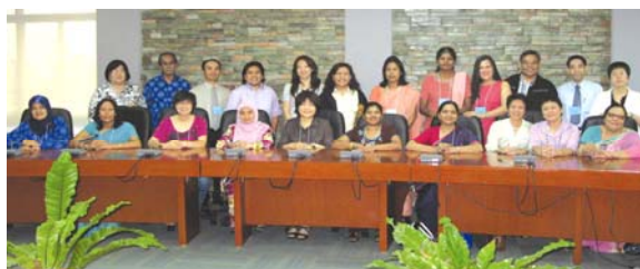
Regional workshop on "Enhancing the Role of Women in Co-operatives"

A conference on the Enhanced Role of Co-operatives in Recovery from the Economic Crisis was organised by ICA AP in collaboration with the Co-operative League of Thailand (CLT) and IFFCO in Bangkok on 2-4 July. The objective was to create a shared vision on the scope and role of co-operatives in the global economic crisis so as to devise a common strategy to reposition co-operatives as the preferred form of enterprises and as global alternative of significance. 75 participants from co-operatives and Governments of 16 countries in the Asia-Pacific region attended the conference.