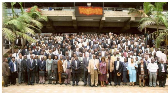
Participants of the Ministerial Conference, Nairobi, Kenya

The Conference was opened in the presence of 100 delegates and hundreds of observers. The delegates included several Ministers and senior government representatives as well as leaders of co-operative movements from a large number of countries. The Conference noted the significant progress in achieving the strategies set out in last Ministerial Conference held in Lesotho in 2005 – particularly in the areas of policy and legal reforms, gender, youth as well as co-operative finance and human resource development, and that further efforts and action are still required – especially in the areas of research, regional integration, HIV/AIDS, strengthening national structures and information and communication technology. In addition they made recommendation on fifteen key strategic areas that will guide the co-operative movement in Africa for the next three years.