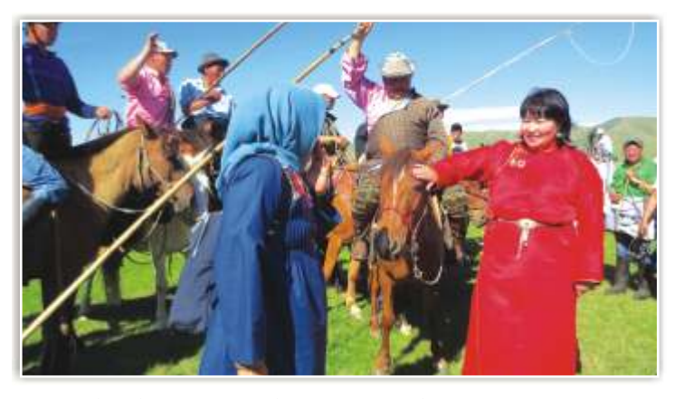
The Chairperson explaining to an Indonesian participant

their products for selling. The chairperson of the co-operative is a women who is a dedicated worker and very much committed to the cause of improving the standard of living of people through co-operatives.