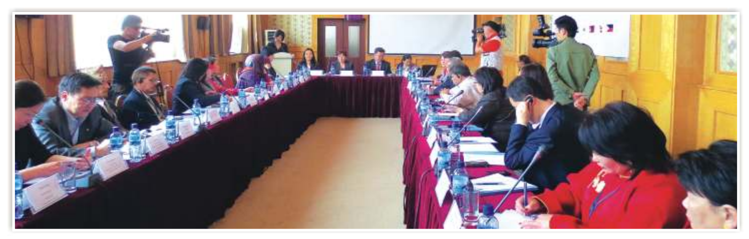
A picture of the opening of the workshop