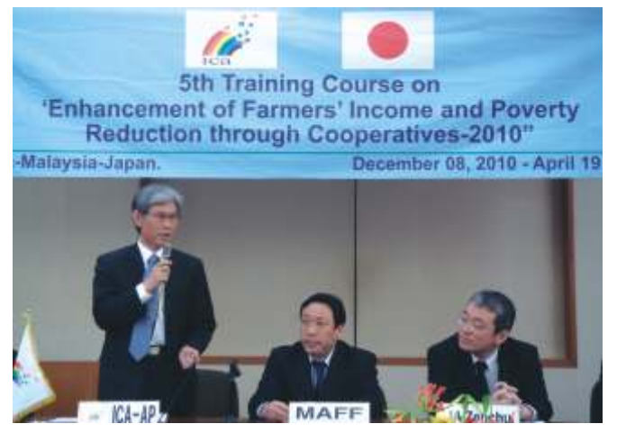
Concluding session At IDACA

operative Organization of Malaysia (ANGKASA) and final part was held at Institute for the Development of Agriculture Cooperation in Asia (IDACA), Tokyo in Japan. The participants were received by various ICA memberorganizations in India, Malaysia and Japan during the course of study visits.