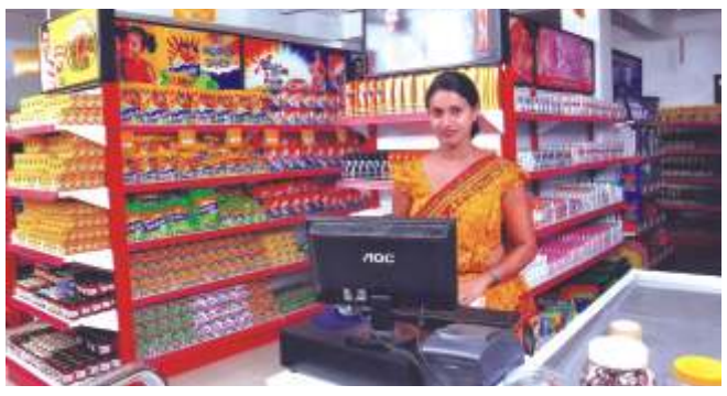
A Coop Store

As the pilot project, Sri Lanka Consumer Co-operative Societies Federation Ltd (Coopfed) of Sri Lanka had opened the largest Super Market at National Institute of Co-operative Development, Polgolla in the Central