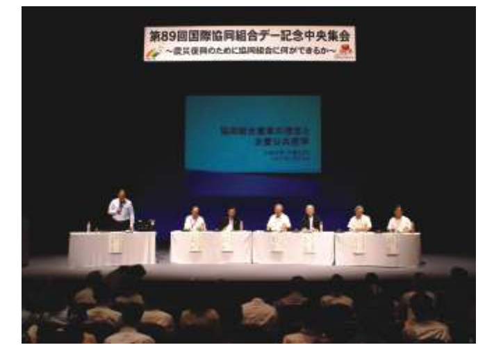
The delegates at the function

It was a successful gathering and all the speakers gave the attendees lots of food for thought.