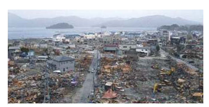
Once prosperous fishing town

immediate relief efforts and long term reconstruction.