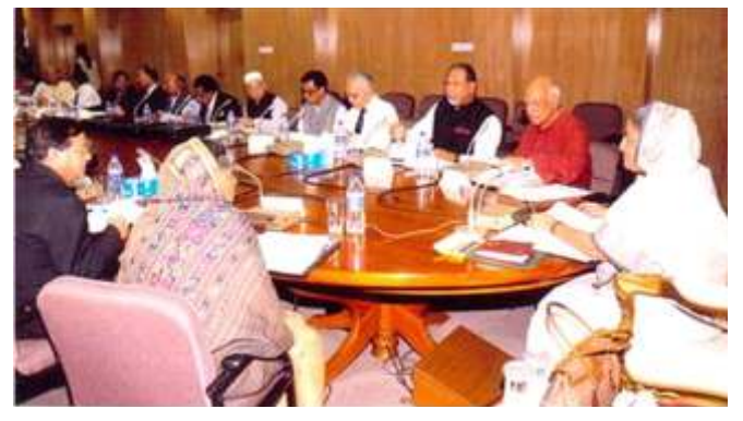
Meeting with the Prime Minister Sheikh Hasina

Cabinet approved the draft Co-operatives (Amendment) Bill, 2011, aiming to expedite the 'Vision 2021' as the present law is not capable enough to achieve the target.