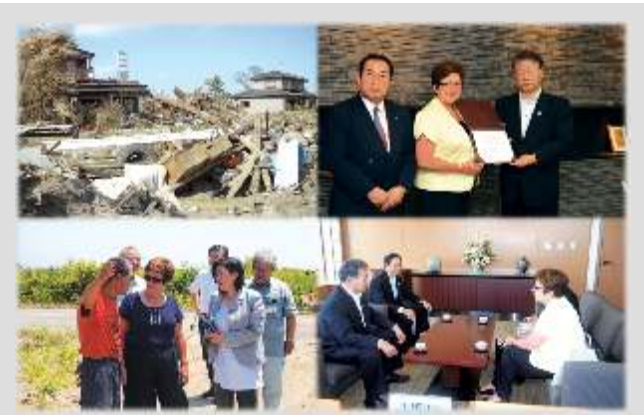
ICA president in Japan

A powerful tsunami has swept across a large area of northern Japan causing major damage, flooding towns and sweeping away buildings. It was triggered by a 8.9magnitude earthquake on 11 March 2011. As reported by the media about 10,000 persons have died, thousands are reported to be missing and a large numbers are seriously injured. ICA and many ICA members have sent letters of condolences and support to ICA members in Japan. In addition, on 16 March the ICA launched an appeal to collect donations for its Japan Disaster Recovery Fund. A number of Japanese members have already established special funds for those that wish to support both the