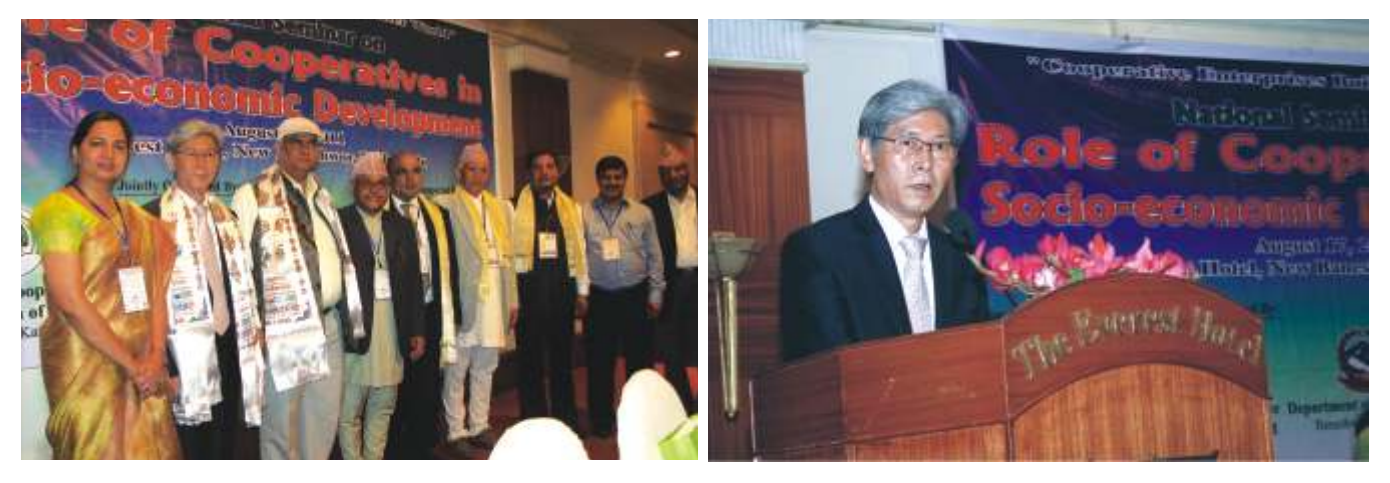
Honourable Minister, Mr. Yadav with delegates