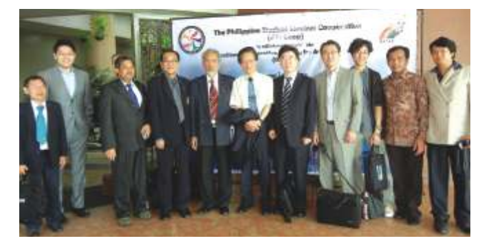
The Group of committee Members

The participants also enjoyed study visit to the consumer co-operatives of Centro Escolar University and the University of the Philippines.