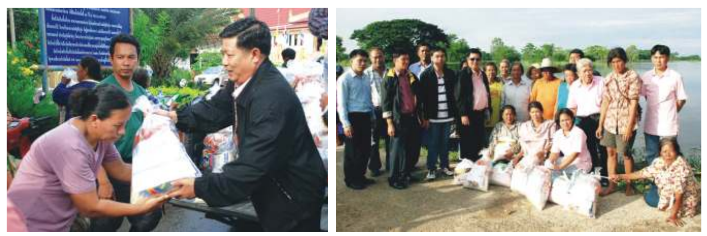
Some of the Victims with Disaster Relief Pakages

The whole nation was devastated. However, 187 cooperatives societies were totally damaged and around 450,000 individual members ware directly affected and remained in bad condition. To provide urgent relief to cooperative sector, CLT mobilised all fund and consumer goods from some of co-operative members in Bangkok area. They made the "Disaster Relief Packages" and gave away to the affected areas. All majority of the flood victims in the affected area had already been evacuated but they will wait for the water to go. For the long term rehabilitation program, CLT has launched the center as "CLT National Flood Relief Center" at CLT Central Offcie in Bangkok to provide emergency operation as a central point to help all co-operative members who were affected from floods, storm, and landslide. The main aims of the center are to act as a central point and communicate immediately with the floods victims in co-operative sector, providing and coordinating operational, and support needs of the cooperative members. It was also to assist in coordination and communication between donors and victims of the floods, storm, and landslide as emergency response and recovery operations. To achieve and provide relief to the flood victims in co-operative sector, CLT, which set up long term plan to relief and recovery of all victims in cooperatives sector are as follows: