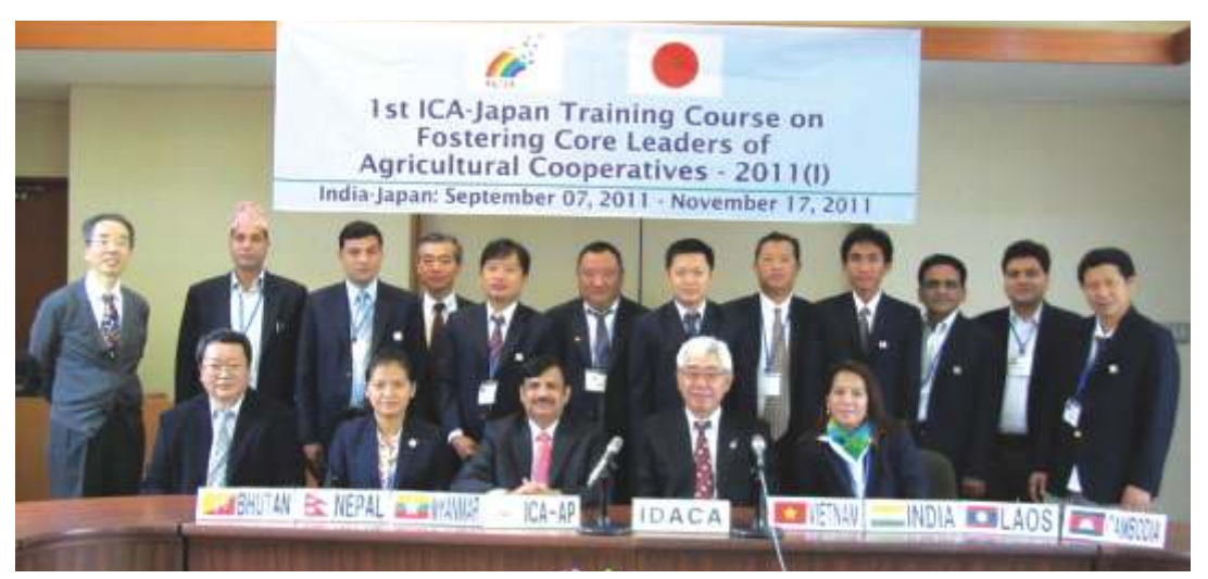
The Group of Participants at IDACA, Japan

Some of the key subjects covered during the training arevarious aspects in the development of agricultural cooperatives in Japan, i.e. farm guidance, joint collection and shipment, business management method of agricultural co-operatives etc. Moreover, the participants are expected to finalize the action plans in Japan for improvement, based on the experience and the knowledge gained during the training course in India and Japan.