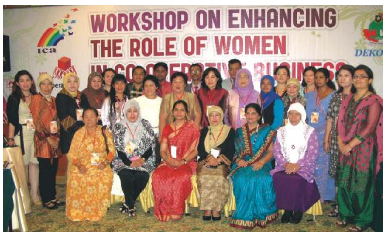
The participants of the workshop

Department and various cooperative attended the workshop to have an exposure of gender focused best practices in Indonesian co-operatives.