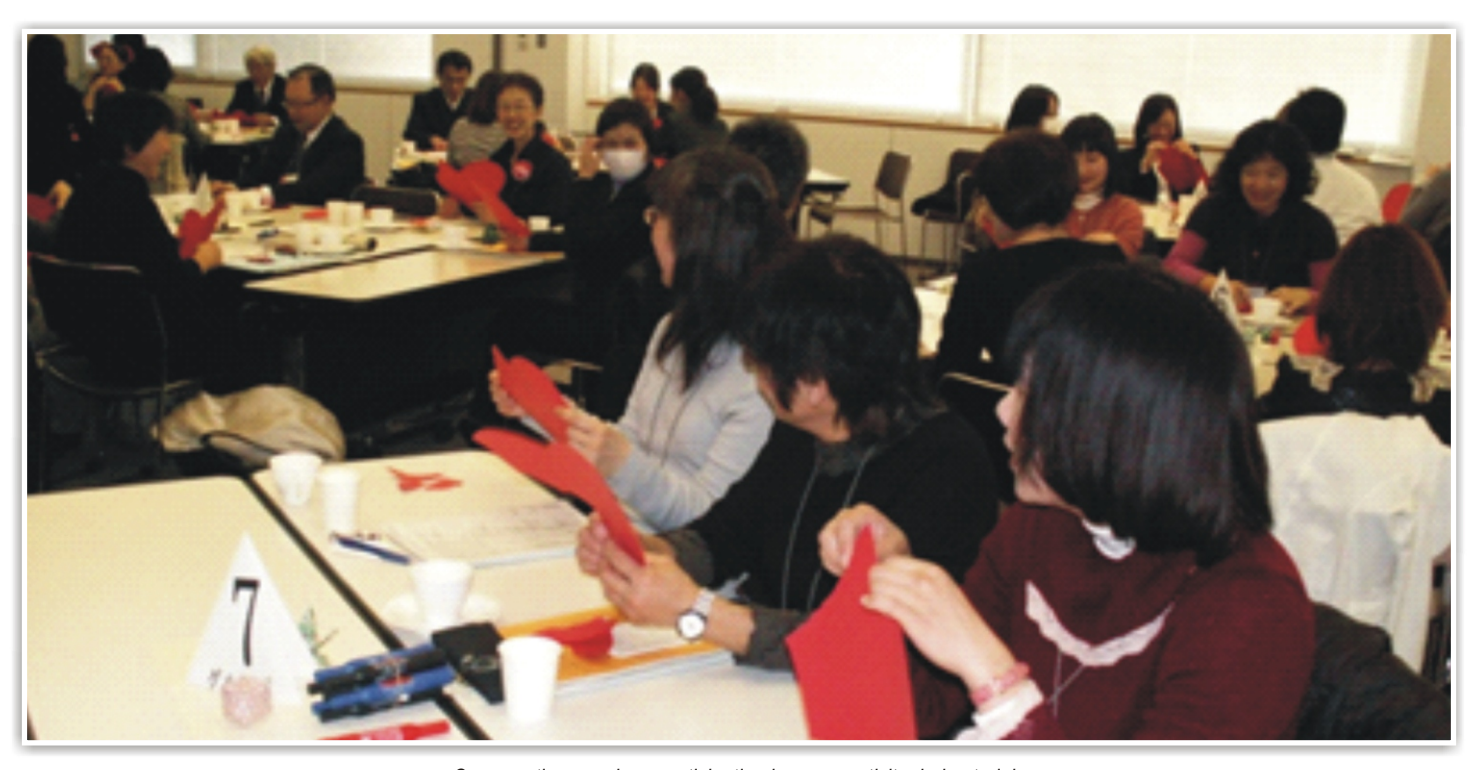
Co-operative members participating in group activity during training