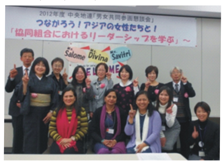
Group of JCCU leaders with international delegates

One of the quizzes was about the position of Japan in the Global Gender Gap Index of 2012. Japan's position is 101st out of 135 countries. This news created quite a stir in the room and participants expressed concern.