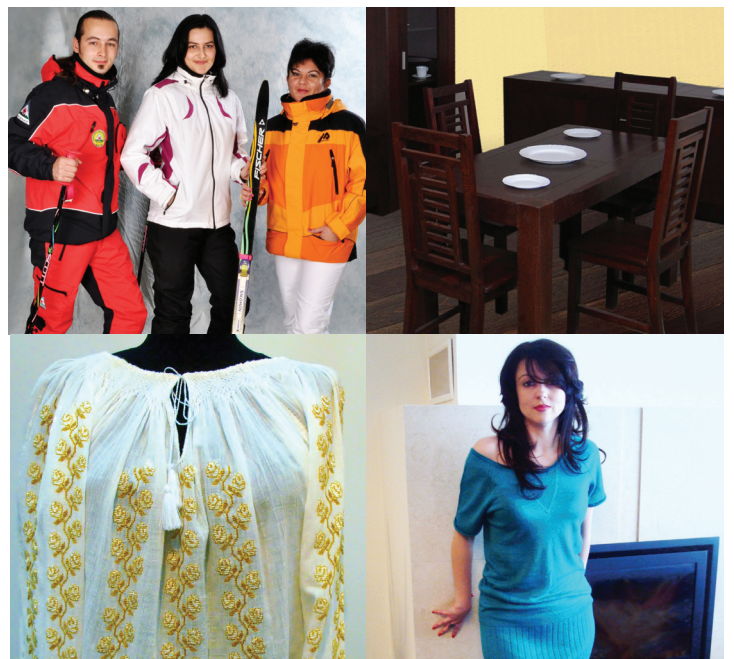
Some products of UCECOM

We welcome you to The National Union of Handicraft and Production Co-operatives of Romania – UCECOM stand to meet your Romanian colleagues and discover a part of the Romanian people’s tradition and soul.