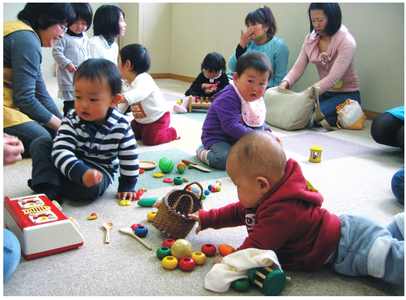
Children are playing in a Child Care Centre