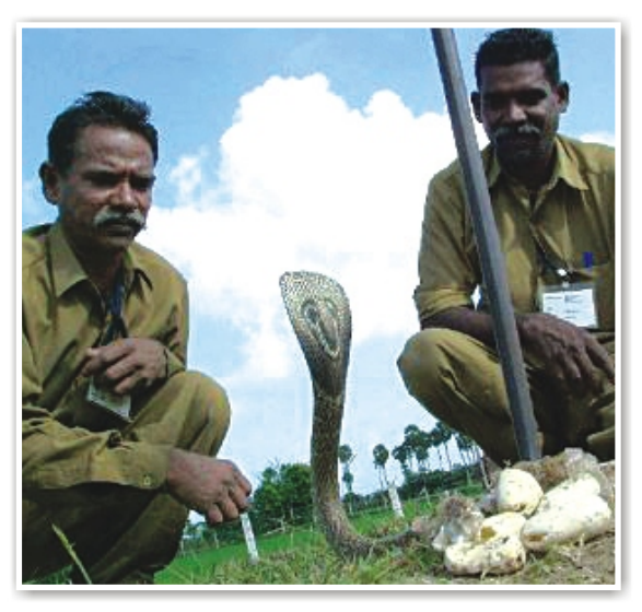
Members catching a Cobra

snakes in the society. Located in the premises of the "Crocodile Park", this co-operative society makes an ideal location for an academic excursion.