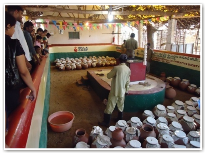
Members displaying various snakes and the method of extracting snake venom

The co-operative started with 26 members and today has more than 350—and is the largest venom-producing centre in India with annual sales of over U.S. $15,000. Snake catchers earn several times more per live snake turned in for milking than they did for reptiles slaughtered for their skins. Being in co-operative hands and following the co-operative