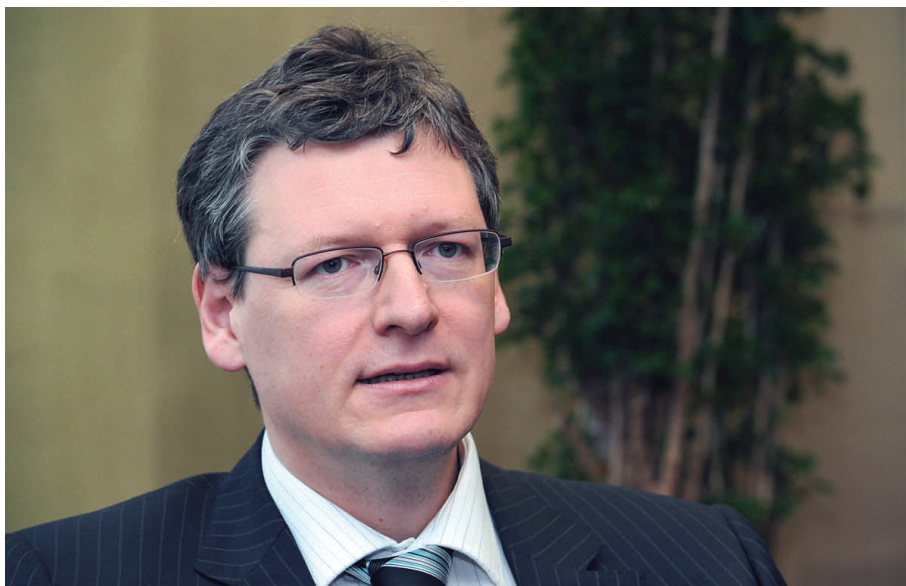
Laszlo Andor, European Commissioner for Employment, Social Affairs and Inclusion

The Commissioner also mentioned the success of the MONDRAGON Cooperative Group and the European Fair of Social Enterprises and Cooperatives of Persons with Disabilities in Bulgaria. He says that cooperatives have "advantages that can be seen more clearly during long economic and financial crises". He emphasizes the established history of the cooperative movement in Central and