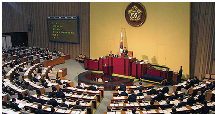
Parliament of South Korea

Although there is no explicit mention of worker cooperatives, the decree - that will be published in October will define them indirectly by allowing worker members to become board members according to the specific composition of the membership structure. While in the law it is forbidden that workers have seats in the board of the cooperative, the draft of this decree defines several exceptions. Among the exceptions, if two thirds of cooperative members are workers, and if non-member workers are less than one third of all workers, cooperatives can have board members composed of worker members. The CICOPA World Declaration and sup-