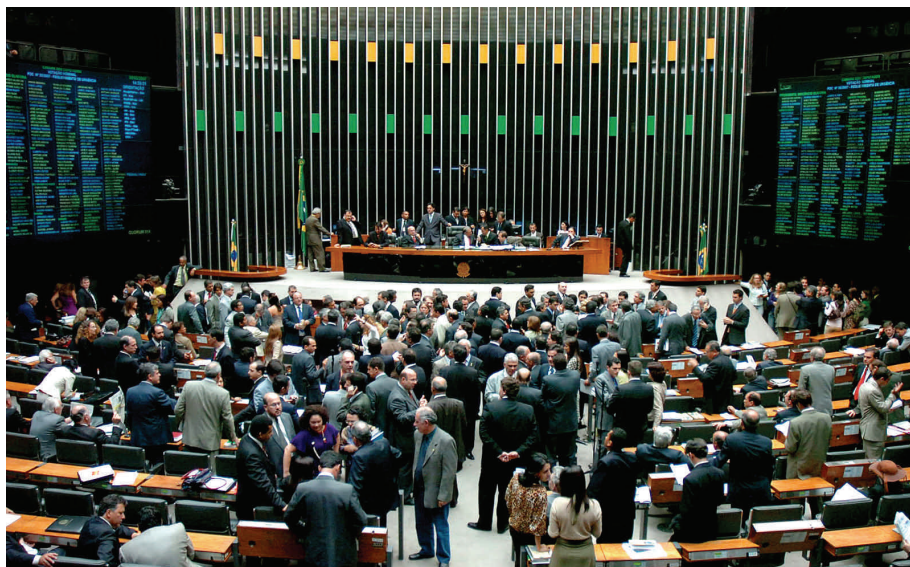
Chamber of Deputies of Brazil

This law establishes a clear regulation on the operation and administrative procedures for worker cooperatives. It is also intended to overcome previous legal problems, such as the creation of pseudo cooperatives, as well as ensuring the rights of the cooperative workers. So that, it is good news for the Brazilian worker cooperatives, CICOPA and its members Central de Cooperativas e Empreendimentos Solidários (UNISOL) and Organização das Cooperativas Brasileiras