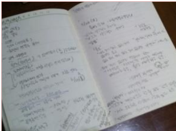
<Activists are using the diary as above>

Besides, to make more convenient to use, organization chart and telephone numbers of iCOOP KOREA are include. The funny stickers of yunsomam (meaning 'mothers who practice ethical consumption' in Korean), the character of iCOOP Natural Dream stores are embodied to encourage using the diary.