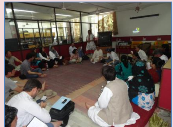
A team from Afghanistan visited The Federation