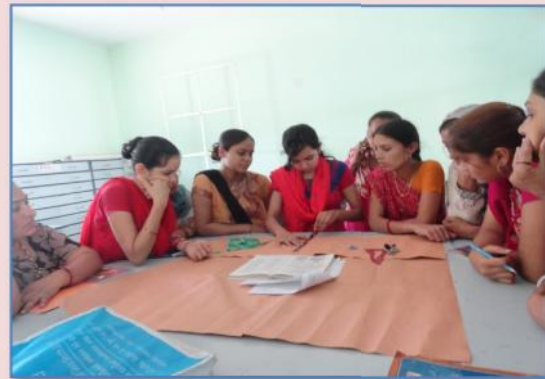
Pattern making training for the artisan members

Training kits for skill development training were given to 20 master crafts persons to enable them to provide the trainings very efficiently.