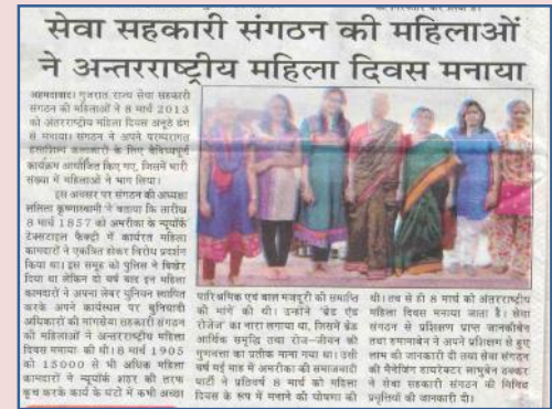
Celebration of International Women's Day was published in 8 news papers