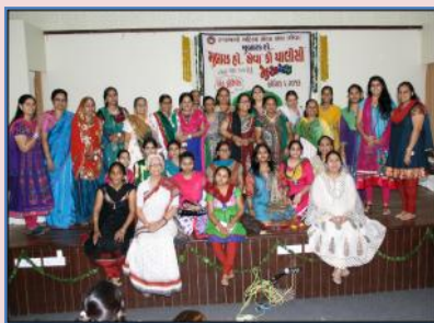
Mushaira at Mehndi Nawaz Jung Hall

“Co-operative training is not merely a prerequisite but a permanent condition of co-operative activities.” - Vaikunthbhai Mehta, Pioneer of Co-operative Movement in India