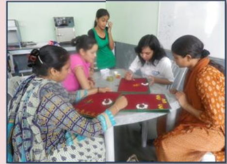
Design development workshop at ALT College

16 samples in fabric painting, stitching, tie & dye, embroidery etc. were developed.