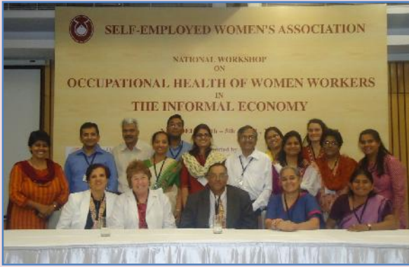
Workshop on occupational health for women workers in Informal Economy

Lokswasthya Sewa Mahila Sahakari Mandli organized a workshop in Delhi on Occupational Health for women workers in the Informal Economy. 77 women workers from 4 different states attended.