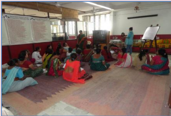
Value based training to the members of Homecare Co-operative