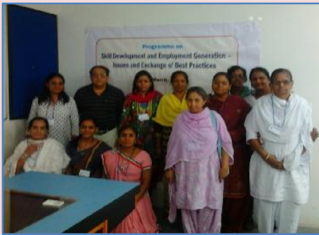
Members of Design Sewa participated in a workshop at EDI

10 organisations from government and non government participated in two workshops organised by Entrepreneurship Development Institute of India. One on Skill Development and Employment Generation - issues and best practices, in which 10 members of Design Sewa participated. The second workshop was on Micro business centers, in which 8 members of the Federation participated. The Federation team presented their Best Practices followed by discussion.